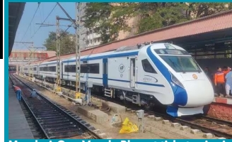
Mumbai-Goa Vande Bharat ticket price is likely to be comparable to airfare

Nauvari sarees are extremely popular in Bollywood and many actresses have worn it in various films.